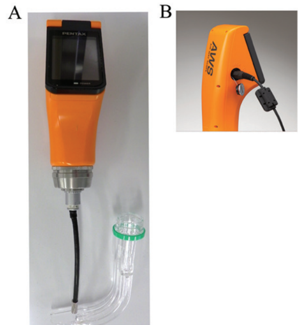
Figure 1. Airwayscope™ (Ricoh, Tokyo, Japan). (A) Frontal and (B) lateral view.

In the present study, a new RLN and SLNEB monitoring procedure was designed, combining an AWS and an FNS during thyroid surgery. Intraoperative identification and functional monitoring of the RLN and SLNEB are crucial in thyroid surgery. Several reports have proposed that EMG monitoring