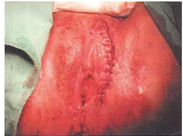
Figure 4. The vulvar tumor was resected with a surgical margin of \geq 1 cm and the wound was closed using the knotted suture technique.

surgery, the patient received adjuvant radiotherapy of the vulvar and inguinal regions bilaterally (external-beam irradiation, 1.8 Gy/day in 25 fractions over 5 weeks; total radiation dose, 45.0 Gy).