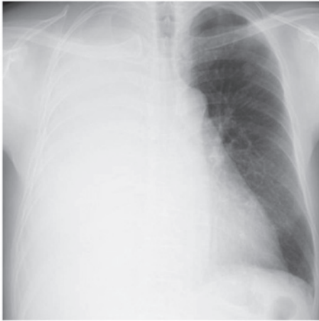
Figure 1. Chest radiography revealed a massive pleural fluid collection in the right hemithorax, with mediastinal shift.